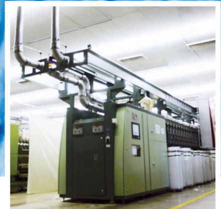
Rieter J10 / J20