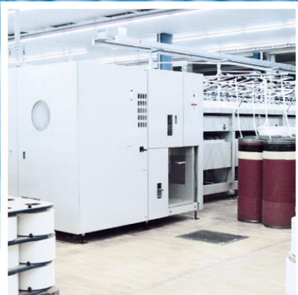
Murate MVS 861 / 870