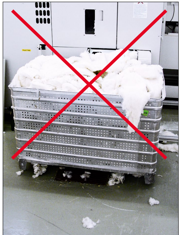
Situation without CVS