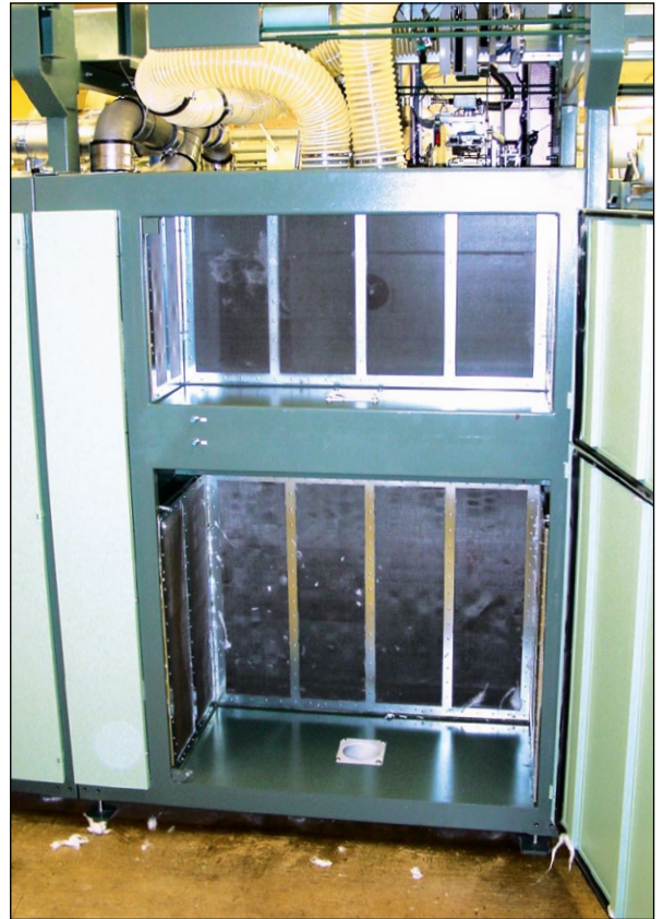
Rieter J10 / J20