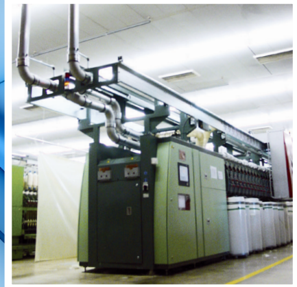
Rieter J10 / J20