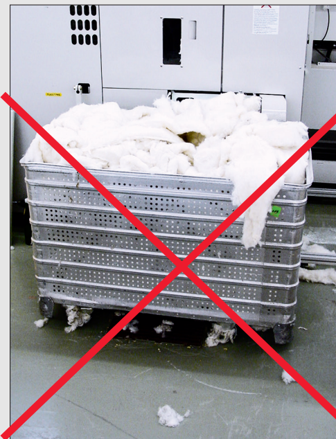
Situation without CVS