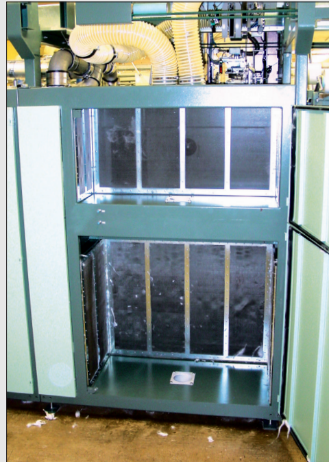
Rieter J10 / J20