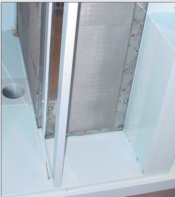
Murata MVS 861 / 870