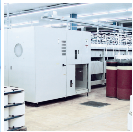
Murata MVS 861 / 870